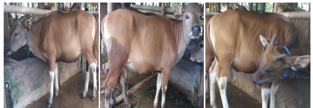
Figure 1. Performance of Balinese cattle fed local grass (left), supplemented with rice bran concentrate (center), and fed commercial concentrate (right).

The results showed that cattle that received concentrate on the final body weight of P0 Group cattle were 166.83 kg; P1 206.50 kg; and P2 198.25kg. The final body weight of group P0 cattle was significantly different (P<0.05) with groups P1 and P2. The final body weight of P1 group cattle was 19.21% as high as P0 (P<0.05) and 3.99% of P3 (P>0.05). The right concentrate mixture on the P1 treatment gives the highest end weight, this is in line with the opinion of Partama (2013) which states that the concentrate will accelerate the body weight gain of cattle and increase feed efficiency better. One optimization to get better feed utilization efficiency is to determine the right amount of concentrate. In Group P1 cattle use commercial concentrates, so that the content of gums or supplements in this concentrate is easier to digest cows.